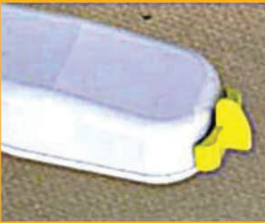
Multi function arm control for easy operation