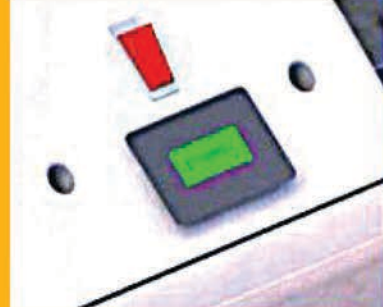
Descriptive text display for easy accurate diagnostics