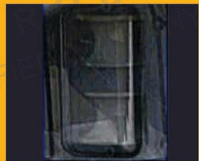
Large rollers and shafts provide increased cycles with low maintenance