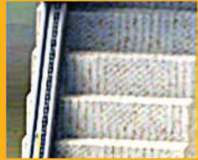
Low profile rail and drive E provides minimal stairway obstruction