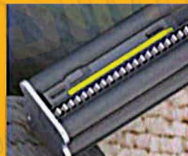
Increased charge contact length reduces the risk of a left off charge situation while still ensuring the user doesn't disembark early