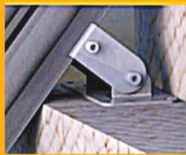
Simple clamping of the legs allows for ease of installation