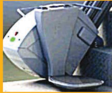
Universal chassis leg assembly is easily mounted to either side of the drive unit