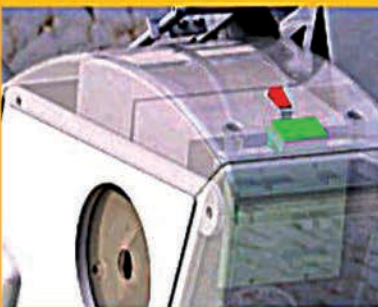
Direct access to the PCB and battery area for ease of maintenance