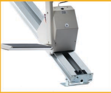
Dual Mounting Faces provide a non handed unit