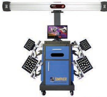
CAR GARAGE EQUIPMENT