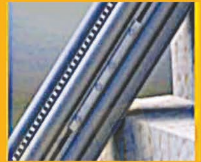
Easily jointed rail with simple clamping arrangement