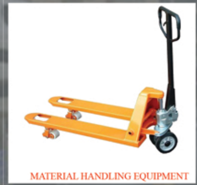
MATERIAL HANDLING EQUIPMENT