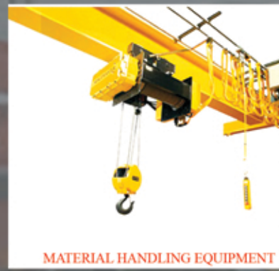
MATERIAL HANDLING EQUIPMENT